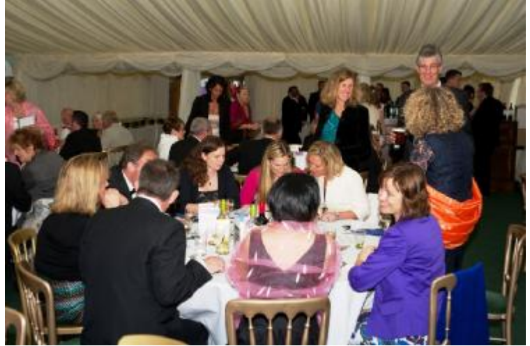
Many guests came from Worcester