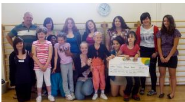
This year's students at MBH

only help to develop a better, more caring society. I hope that our relationship with the school will continue to develop new opportunities for them and us”.