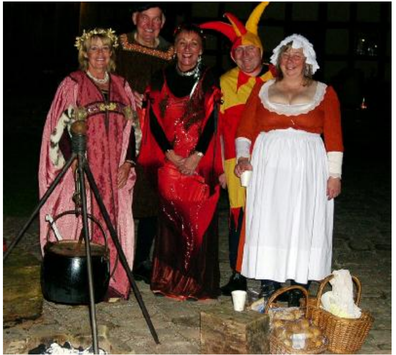
Revellers around the fire