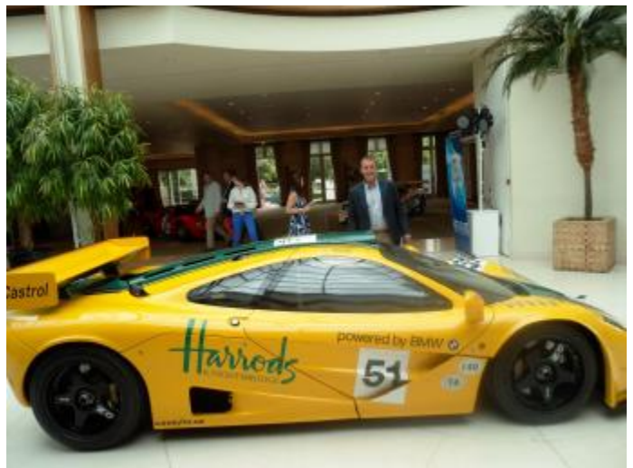
"Decision made - I'll have this!"