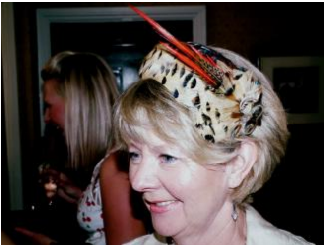
Cook it, eat it, wear it!