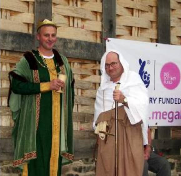
King John (Beavan) with the royal friar